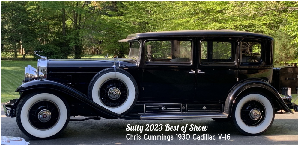
Sully 2023 Best of Show Chris Cummings 1930 Cadillac V-16

Exhibition Fees: Show Vehicles: $10 PRE-REGISTRATION ONLY Auto, Antique & Craft Flea Market Spaces: $30 pre-registered; $40/gate. Car Corral: $30 pre-registered; $40/gate Pre-registration deadline is June 12, 2024