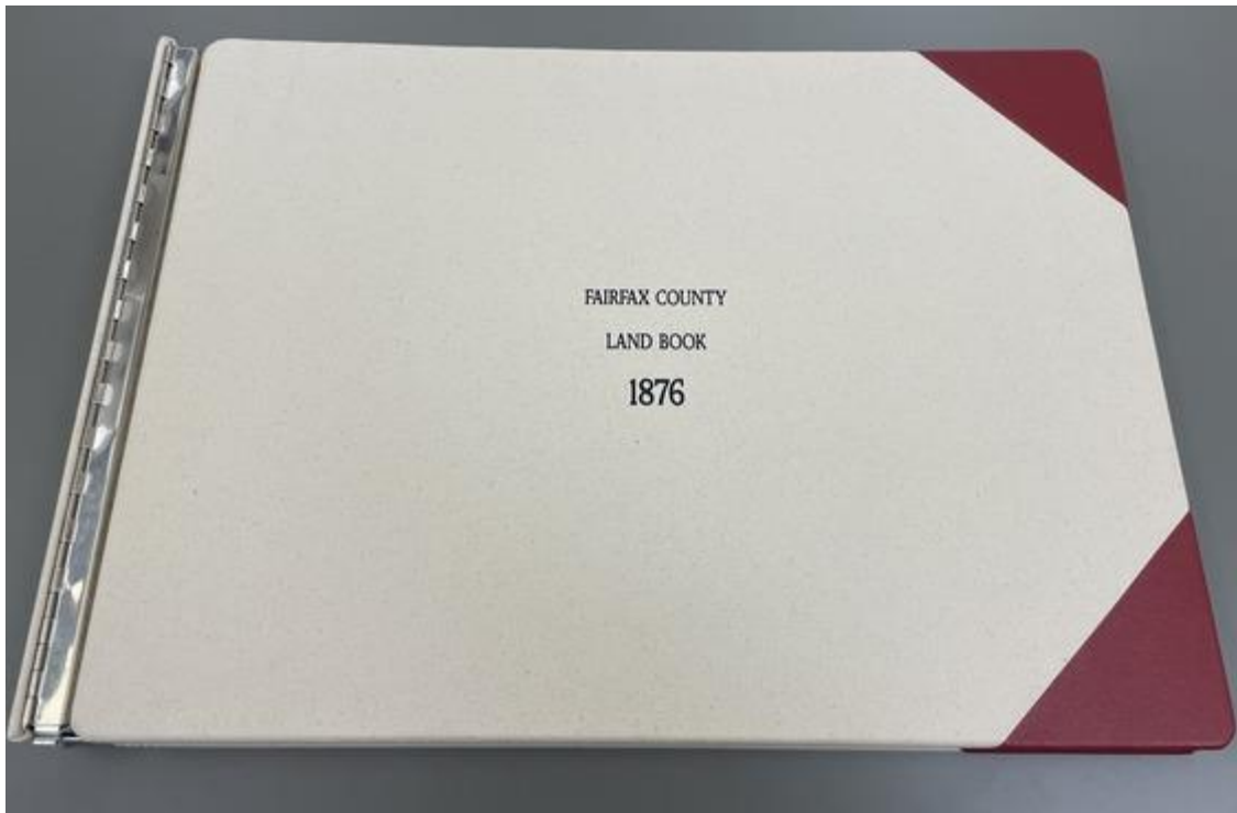
Fairfax County 1876 Land Tax Book