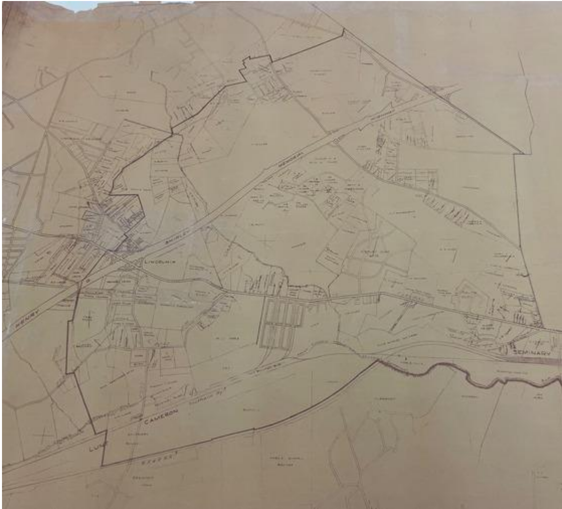
Alexandria Annexation Map

Our Land Tax records are particularly useful for researchers looking into historic homes and properties. Since Land Tax books after 1820 contain separate values for the acreage of land and the structures on the property being taxed, they are some of the only records that can verify a construction date on a historic home in Fairfax County. If a property was taxed as only land with no structures on it in one year, but had a value listed for a structure the following year, it is reasonable to believe that year was the construction date of a building or home on the property. It is also common for the structure value to be quite low, and then jump up to a much higher value, indicating there could have been simply a barn or storage shed at first, and then a house built after. Usually there is a note indicating the reason for a tax adjustment, being a building added, improvements made, or a fire. These tax books are used quite frequently by our researchers and are some of the most fragile and worn records in our collections, as seen in the images below.