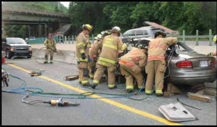
Car crash, outer loop of the beltway prior to Route 123.