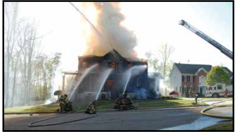
Firefighters battle a two-story house fire in the 9200 block of Forest Greens Drive, Lorton. An unattended candle on the front porch caused the fire.

The Fairfax County Fire and Rescue Department operates on three separate 24-hour rotation shifts. Each shift is led by a Deputy Fire Chief. The county is separated geographically into seven battalions, each managed by a battalion management team of a Battalion Fire Chief and EMS Captain. Fire suppression personnel and paramedics work in tandem to ensure the highest level of safety and care possible for the residents of Fairfax County.