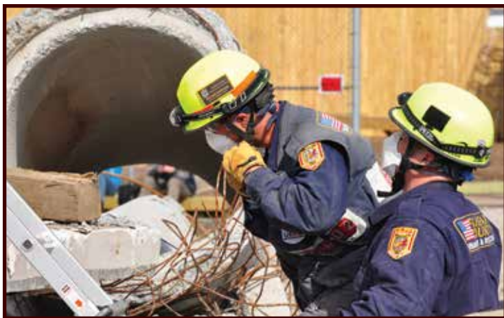
VATF-1 members took part in a three-day reclassification exercise.

Virginia Task Force 1 (VATF-1) - a premier humanitarian disaster response resource governed through federal partnerships with United States Agency for International Development, (USAID), Department of Homeland Security, (DHS), and the Federal Emergency Management Agency, (FEMA). Deploys nationally and internationally to natural and man-made disasters on short notice. Teams have deployed to Armenia, Kenya, Turkey, Taiwan, Iran, Haiti, Oklahoma City, The Pentagon, Japan, and numerous other disaster locations within the US and abroad. Costs and expenses for training, equipment, supplies, and personnel are paid for by the federal government.