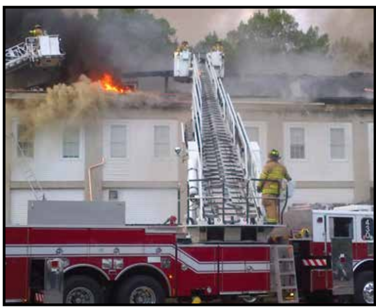
A three-alarm structure fire occurred on Fort Belvoir August 13, 2012.