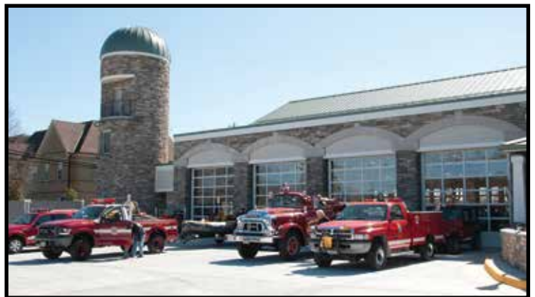
Fire and Rescue Station 12 Grand Opening was March 10, 2011.

FIRE AND RESCUE STATION 12, GREAT FALLS – The grand opening for the two-story, 18,700 square foot firehouse was held March 10, 2012, with the traditional "hose uncoupling." The station was designed to be environmentally friendly, and integrate into the rural setting of the Great Falls community.